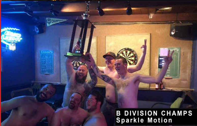
B DIVISION CHAMPS Sparkle Motion