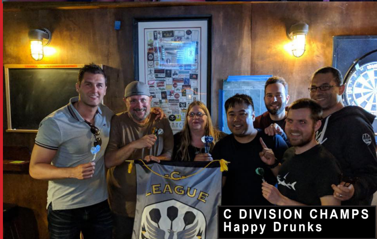
C DIVISION CHAMPS Happy Drunks