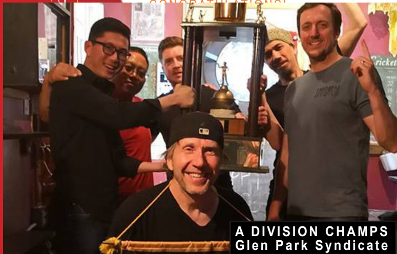
A DIVISION CHAMPS Glen Park Syndicate