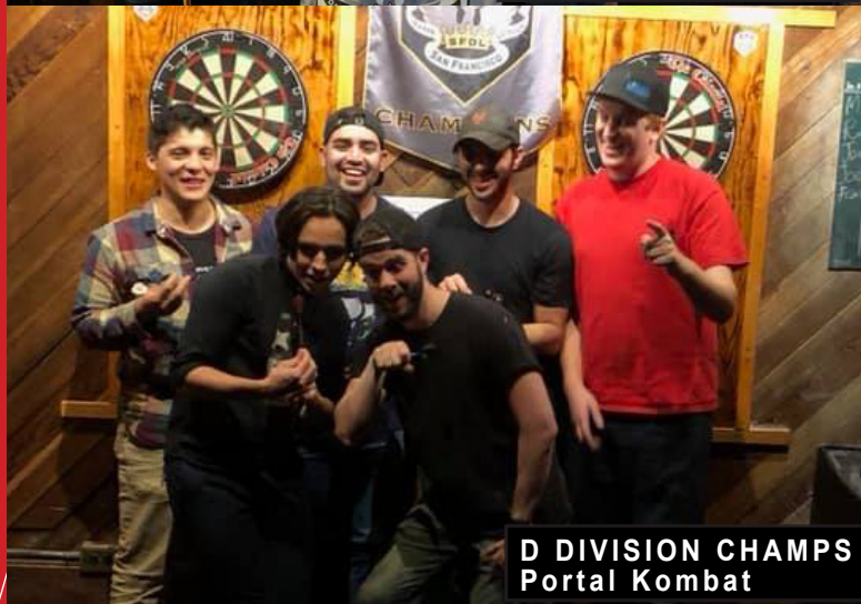
D DIVISION CHAMPS Portal Kombat